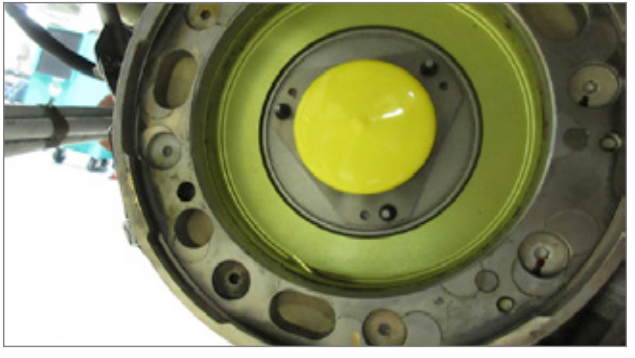
IDG drive pad