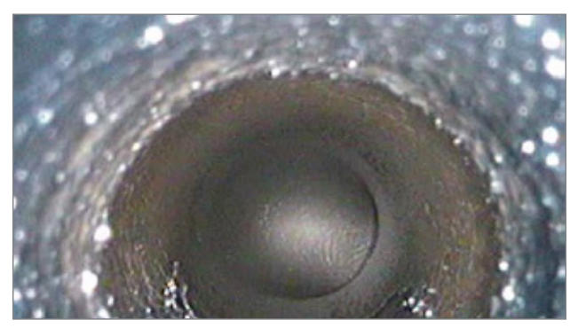
Supply tube view from the locating flange area towards the elbow transition

Typically the #5 oil supply tube suffers coking predominately in the area around the elbow and locating flange due to heat conduction from the TRF.