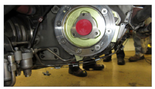
ATS drive pad

All line-replaceable units (LRUs) were removed from the AGB with the exception of the fuel control unit (FCU), and the exposed drive pads showed no evidence of oil leakage.