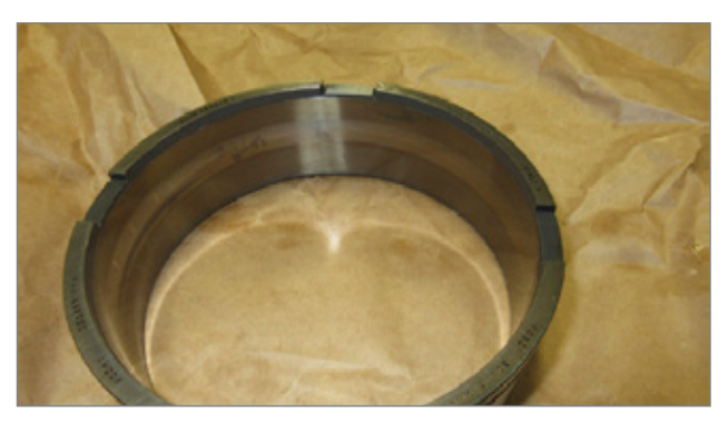
Bearing #5 outer-race ID