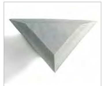
LOCTITE syntactic core machined shape