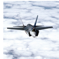
CLASSIFIED PROGRAM MANAGEMENT