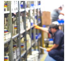
VENDOR MANAGED INVENTORY