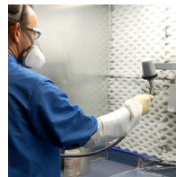
INTERMIX PAINT SERVICES